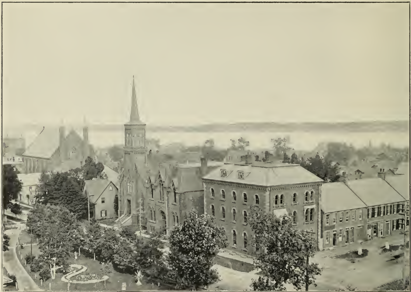
VIEW EAST OF POST OFFICE, CHARLOTTETOWN, P.E.I.